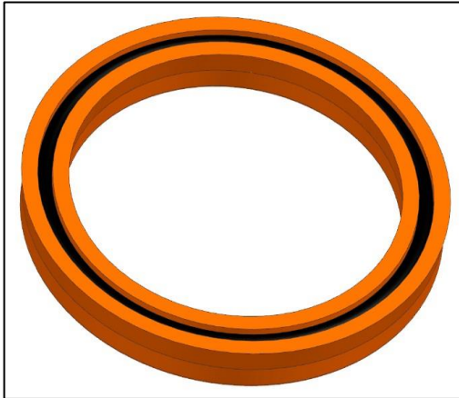
Fig. 2 Ø56mm Parker Ram Seal

Please be aware that for Hydrostatic Ram housings, if upgrading from the discontinued ram seals ( Part # MT56X72X8-PU & MT56X72X8-PU1 ) to the new Parker Ø56mm Ram Seal, the 4051671B Seal Spacer will need to be replaced with 4202630 (2 per machine). This will maximise seal performance by reducing the axial clearance within the Sealpack. The Ø56mm Parker Ram Seals are orange in colour and assembled in packs of 3 as shown below: