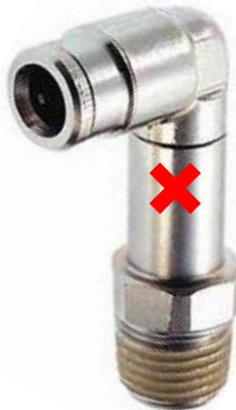
Fig. 2 Extended Swivel Elbow Version 2 -19mm A/F Hex (101541038)