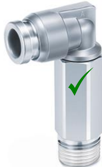
Fig. 3 Extended Swivel Elbow Version 3 -17mm A/F Hex (23218480)

Version 1 of the 101541038 Extended Swivel Elbow is still suitable to use if existing stock is available, as any Extended Swivel Elbows purchased before March 2022 are likely to be of Version 1's design. Version 3 of the Extended Swivel Elbow ( 23218480 ) can be purchased from the CMbE Sales Department, as detailed below, and is the standard on all new Die Necker machines.